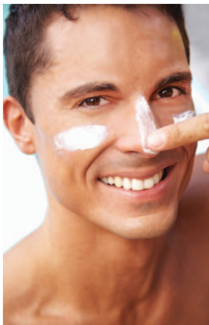
Effective sunscreens from Europe may soon spread to the US.

Several formulations were made with combinations of zinc oxide and titanium dioxide augmented by the two new TEA UVA ingredients only. Extremely photostable formulations with medium to high SPF (50+) and broad spectrum protection were achieved. Formulation E yielded an SPF of 59.4 and a \lambda_c of 379nm, and formulation F had an SPF of 28.75 and \lambda_c of 379nm. Note that bisoctrizole has a \lambda_{max} at 360nm (UVA-absorbance) with a critical wavelength \lambda_c of 388nm contributing